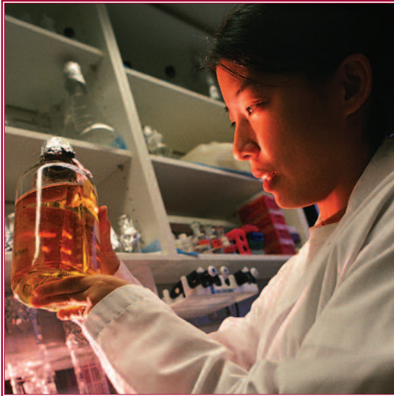
Glass used in an MIT Research Lab.