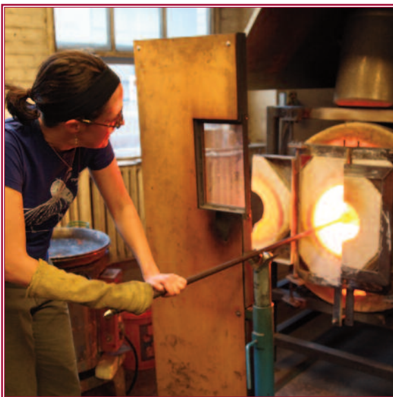
A glass blower in the MIT Glass Lab creating a glass pumpkin.