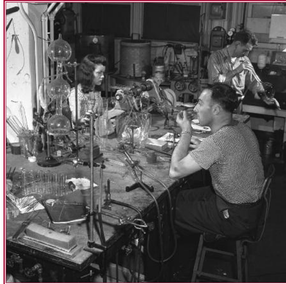
Glass blowing in the Rad Lab (Building 52) during World War II.