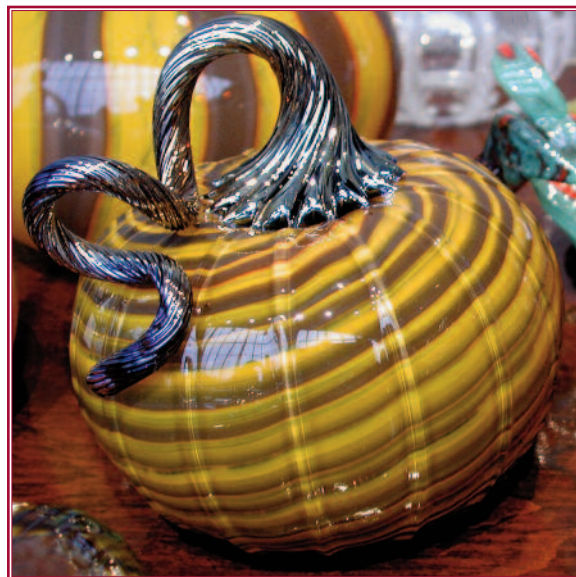
MIT Glass Lab pumpkin.