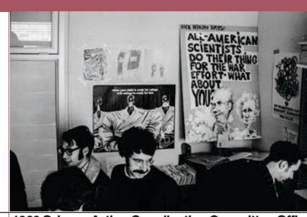
1969 Science Action Coordinating Committee Office

A 21st century undergraduate education should be quite the same as an excellent 20th or even 19th century education: a simultaneously broad and deep education, exploring across subjects and burying deep in a few. At its core, excellent education is about learning how to learn – more about developing habits of mind, more about both disciplined and imaginative inquiry than about particular substantive information, theories, or methodological techniques. Ultimately, education should destabilize taken-for-granted