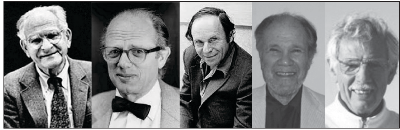
Members of the MIT Physics Department 1969

Why was MIT the locus of the scientists' strike? The MIT Physics Department faculty had a long history of opposition to nuclear weapons. The scientific leaders of the Department were also leaders of the nuclear disarmament movement . . . .