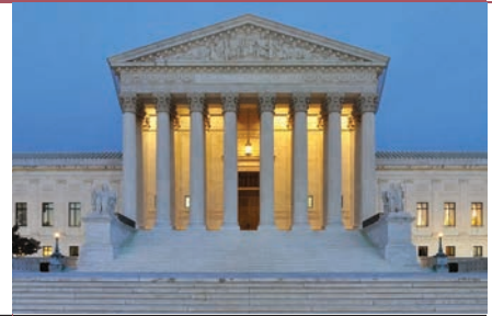
Supreme Court Building at Dusk

in this issue we offer “A Brief History of the Origins of the Faculty Newsletter” ( page 3 ); the resumption of our From The Faculty Chair feature ( page 4 ); “Civil Discourse in the Classroom and Beyond” ( page 7 ); and a report by the Graduate Student Union on the recent agreement between the administration and the GSU ( page 8 ).